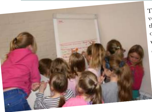
The girls voting for their choice of movie, Worlds Greatest Showman won the vote!