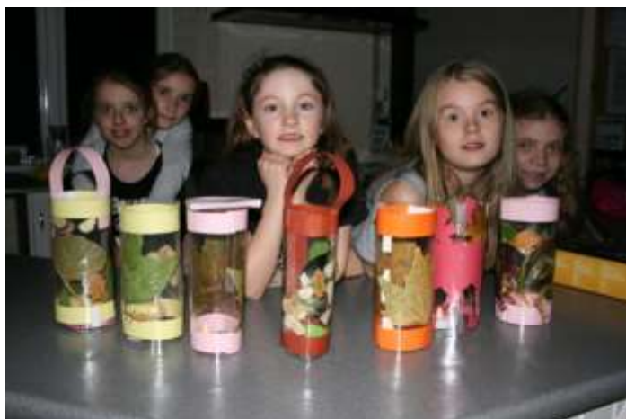
Autumn Leaves Tea Light Shades