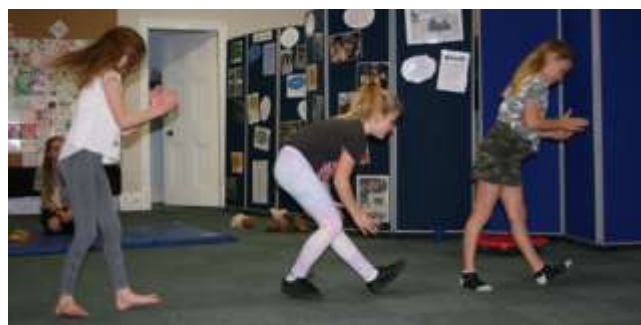
The Girls at UTASS have certainly got talent !