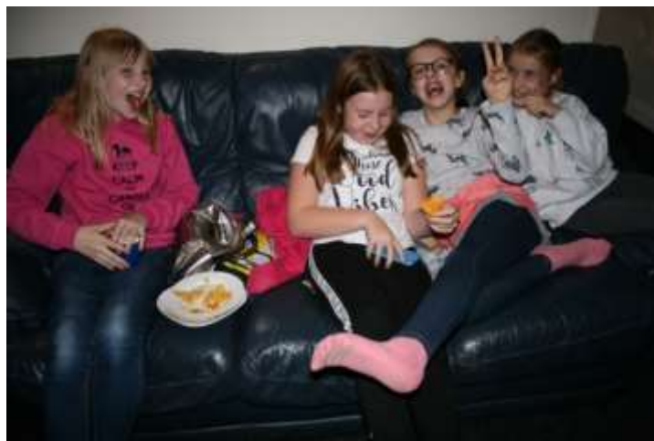
Girls group enjoying cinema snacks at Movie Night Upstairs at UTASS