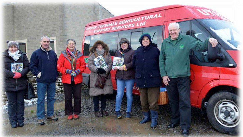
Photograph taken at MiDAS Training course

We are also delighted to say that we have been successful in our application to the Government Minibus Fund for another 10 seater minibus, which will also incorporate a ramp for all abilities access. This minibus is expected to arrive in June 2016 and drivers will not need to have D1 on their licence.