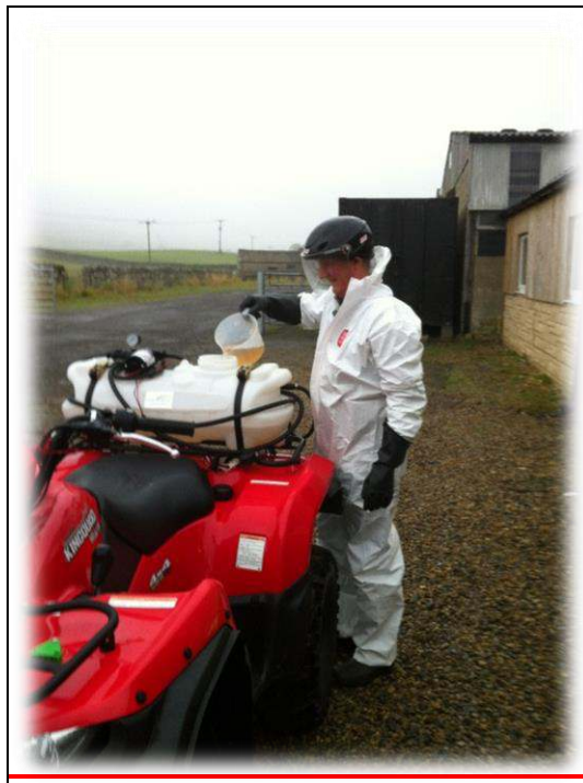
Photograph taken at Spray Training