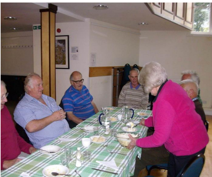
Monthly Cree Lunch at St Johns Chapel