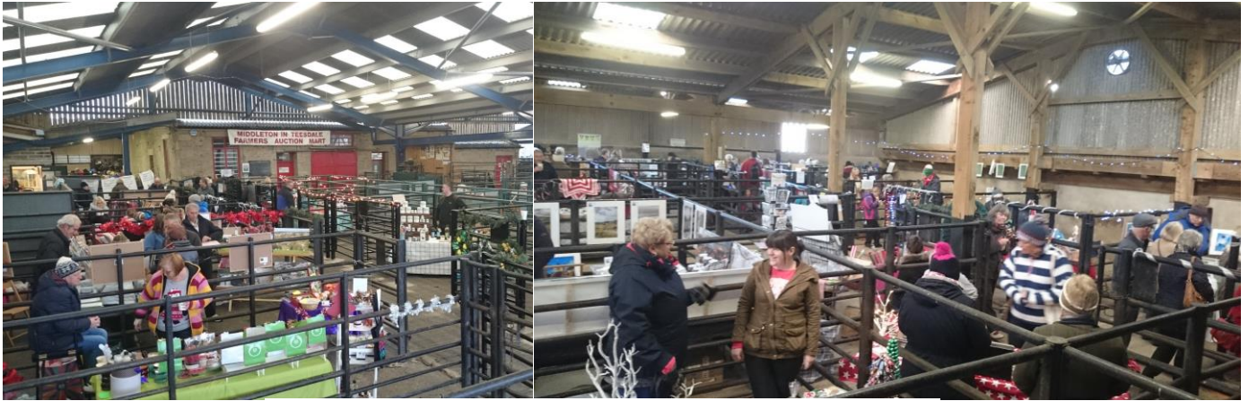
The Christmas Fair held in 2016; Photographs courtesy of Emma Spry