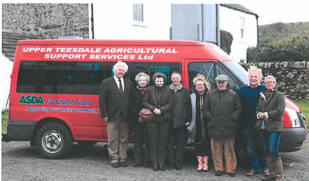
The UTASS Mini Bus being used for a farm visit in Teesdale

Was very well used by a range of community groups and provided a regular Thursday evening service bringing in young people to UTASS from the most isolated parts of the upper dale.