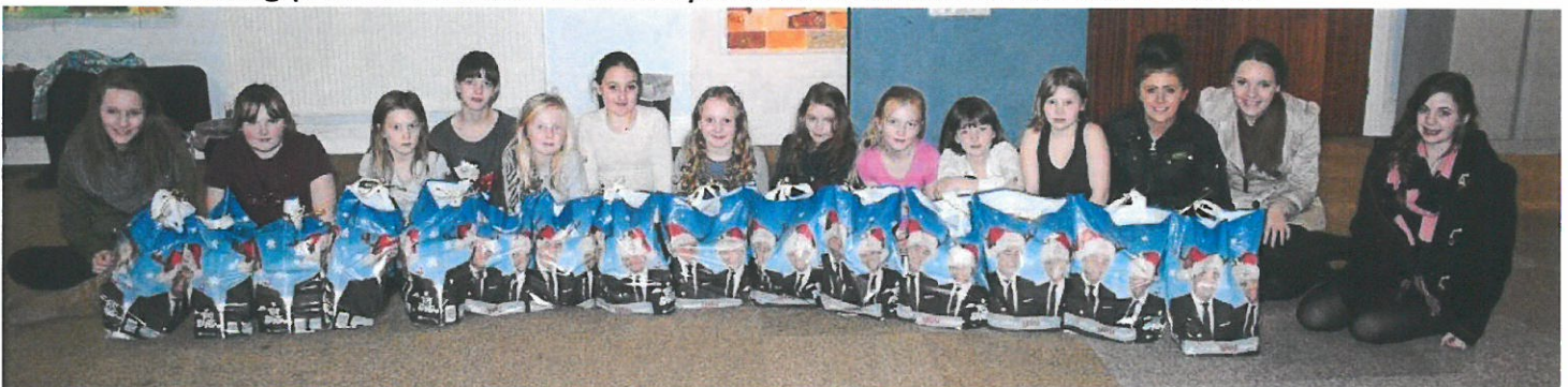
The Monday Night Girls Group with the food hampers they prepared for the Cameron Relief in Sickness Fund